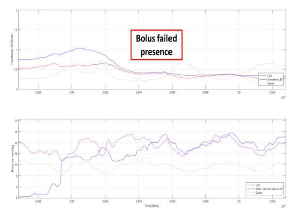
Figure 2: Bolus flow failed to transmit through the gastro esophageal junction. The top panel presents the impedance signals which were used to determine the bolus presence. The lower panel presents the pressure signals which used to determine the flow permissive pressure gradient.