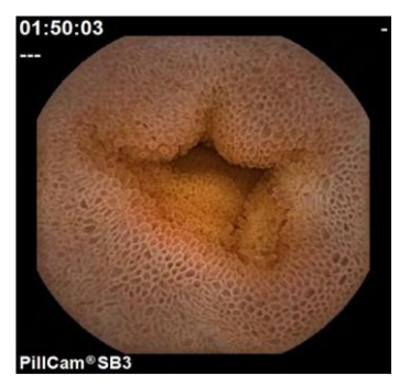
Figure 2 : HP enteropathy: edema.