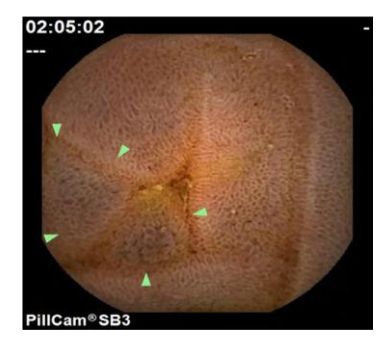
Figure 3: HP enteropathy: varices