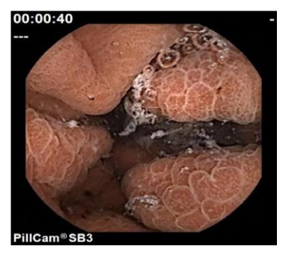
Figure 1: HP gastropathy.

It has been observed how patients with Child-Pugh stages B and C, esophageal varices, low levels of hemoglobin or lesions compatible with gastropathy and / or portal hypertensive colopathy present a higher prevalence of PH enteropathy. Currently, given the limited evidence in this regard there are no specific recommendations for its management, being the use of betablockers, somatostatin or coagulation with argon gas some of them.