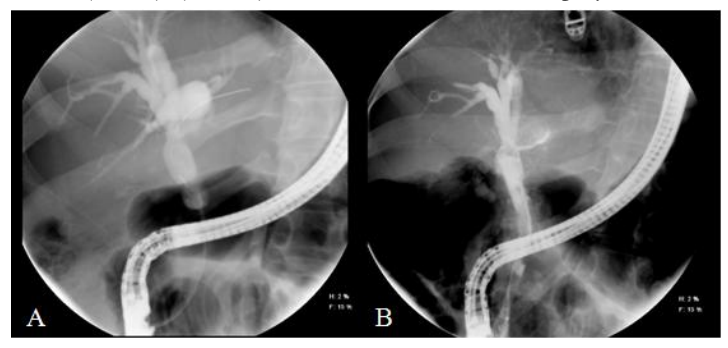
Figure 4: Endoscopic cholangiography of a patient with portal cavernous cholangiopathy. Dilation of the intra and extrahepatic biliary tract with distal main biliary duct stenos is observed (A). Biliary endoprotesis insertion (B).

Treatment was focused on portal hypertension control and the management of biliary tract obstruction. Seven patients (29.2%) required only medical treatment with non-selective beta blockers. In pro-thrombotic pathologies, oral anticoagulation was used. Most of the complications caused by biliary tract obstruction were treated endoscopically, with biliary stent placement in 10 patients (41.7%) and sphincterotomy in one patient (4.2%) (Figure 4). Surgical treatment was required in 10 patients (41.7%). It was combined with medical treatment in 3 cases (12.5%) and with endoscopic treatment in 5 patients (20.8%). (Table 3) describes the treatments employed.