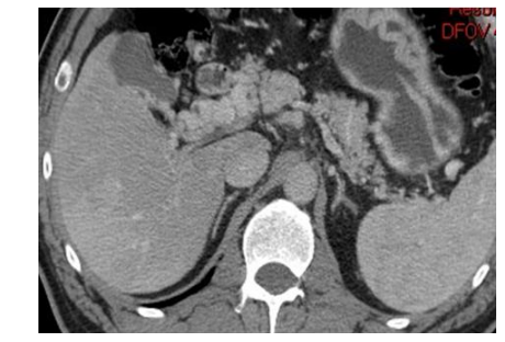
Figure 2: Cavernous degeneration of the porta. A mild dilation at the intrahepatic biliary tract is observed. Extensive perigastric and peripancreatic collateral porto-sistemic circulation. Splenomegaly.