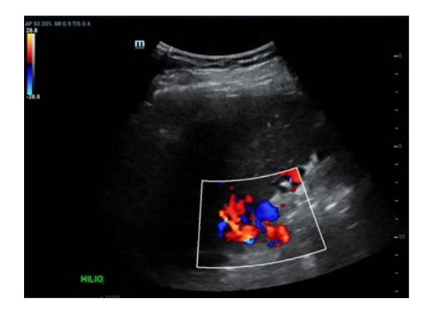
Figure 1: Doppler ultrasound showing multiple periportal veins at the hepatic hilum corresponding with a portal cavernoma.

Laboratory test results were evaluated at the time of diagnosis showing normal CBC parameters. Jaundice was present in 8 cases (34.7%) and the rest of the liver function tests showed a cholestatic pattern with mild transaminase elevation (Table 1).