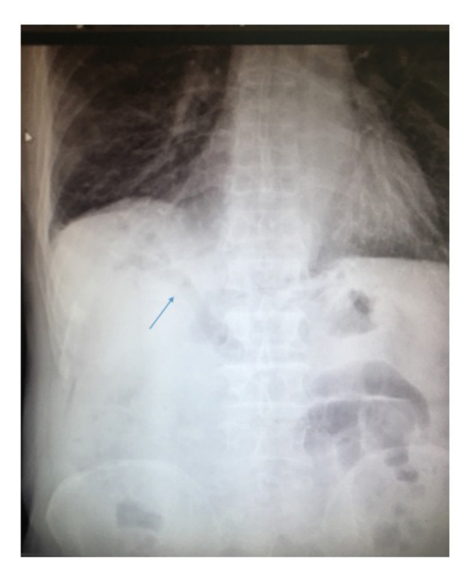
Figure 1: A plain radiograph showing presence of air in the biliary system

The patient was discharged on the tenth day after surgery. After a two-month regular clinic follow-up visits patient was in good condition.