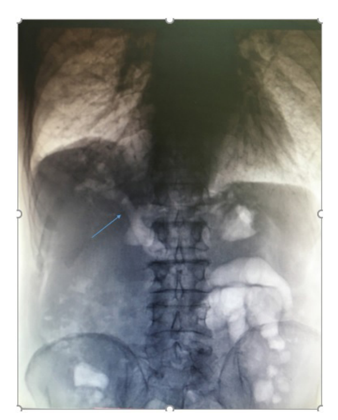
Figure 2: Negative of plain radiograph; air in the biliary system