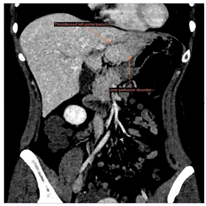
Figure 3: Coronal CT image. Diagnosis of pylephlebitis with impaired perfussion in segment II of the liver

vention of thrombus extension and its sequelae. Intravenous treatment was maintained until a clinical and radiological response was observed on the tenth day. The remaining antibiotic course was completed with oral agents, in the same regimen until completing 6 weeks of treatment (Figure 3).