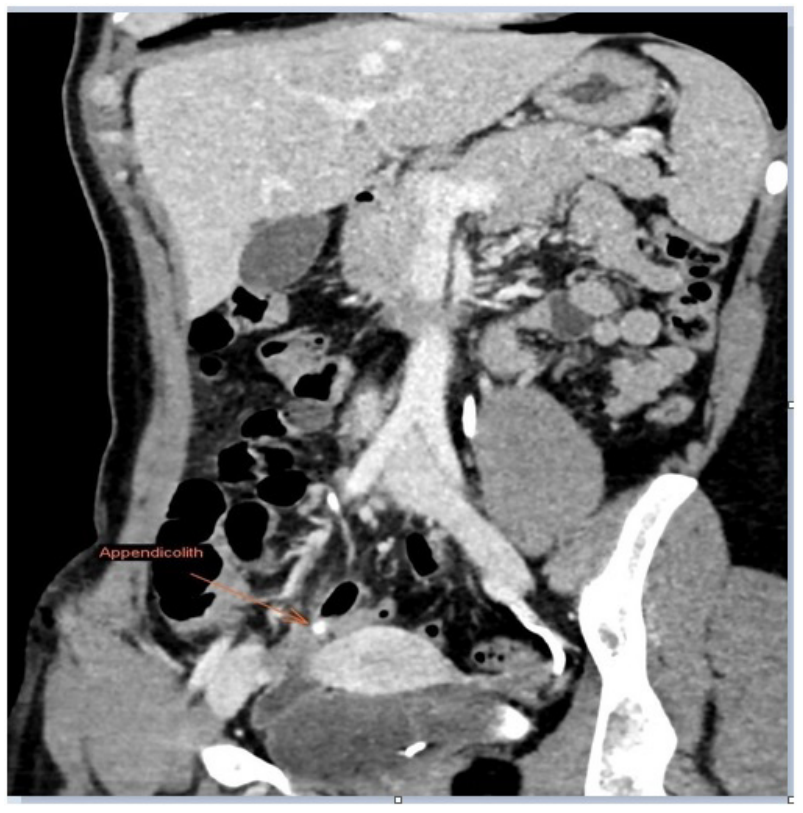
Figure 2: Coronal CT image. Diagnosis of acute appendicitis. Hepatic parenchyma without pathological findings.

With a high radiological suspicion of pylephlebitis, broad-spectrum intravenous antibiotic therapy with ciprofloxacin (400 mg every 12 hours) and metronidazole (500 mg every 8 hours) was started while waiting for the blood culture. Anticoagulation is associated as pre-