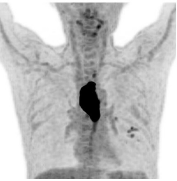
\textbf{Figure 2B}. \ \text{PET MIP showed hypermetabolic mid esophageal lesion without metastasis}.