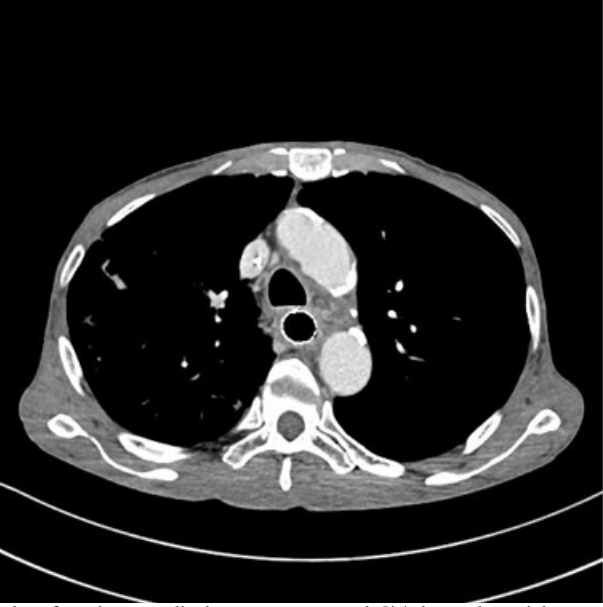
Figure 5. At 6 months after chemoradiotherapy contrasted CT showed partial response at primary site.