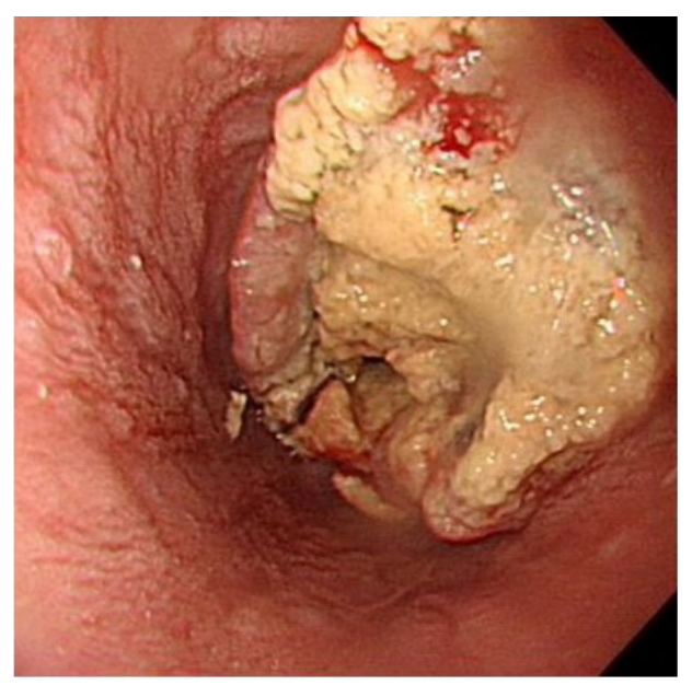
Figure 1. Esophagogastroduodenoscopy (EGD) showed a circumferential mass forming stricture at mid esophagus.