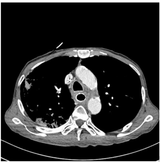
Figure 4. CT of an esophageal endoprosthesis for tracheoesophageal fistula of malignant origin.