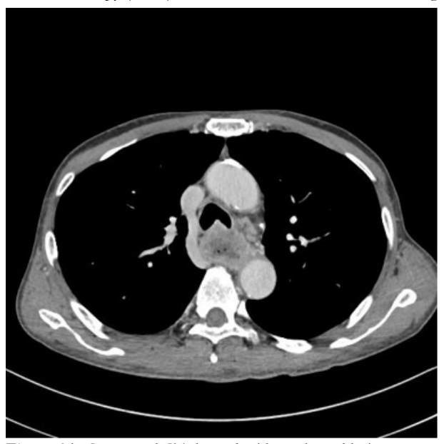
Figure 2A. Contrasted CT showed mid esophageal lesion.