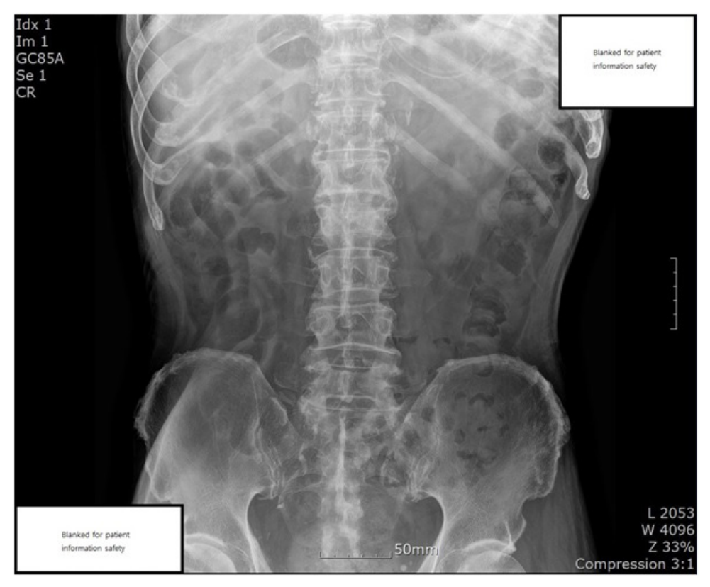
Figure 1: Colon feces lumen formation: Patient reported of having diarrhea and abdomen x-ray showed formation of feces lumen and feces clump.