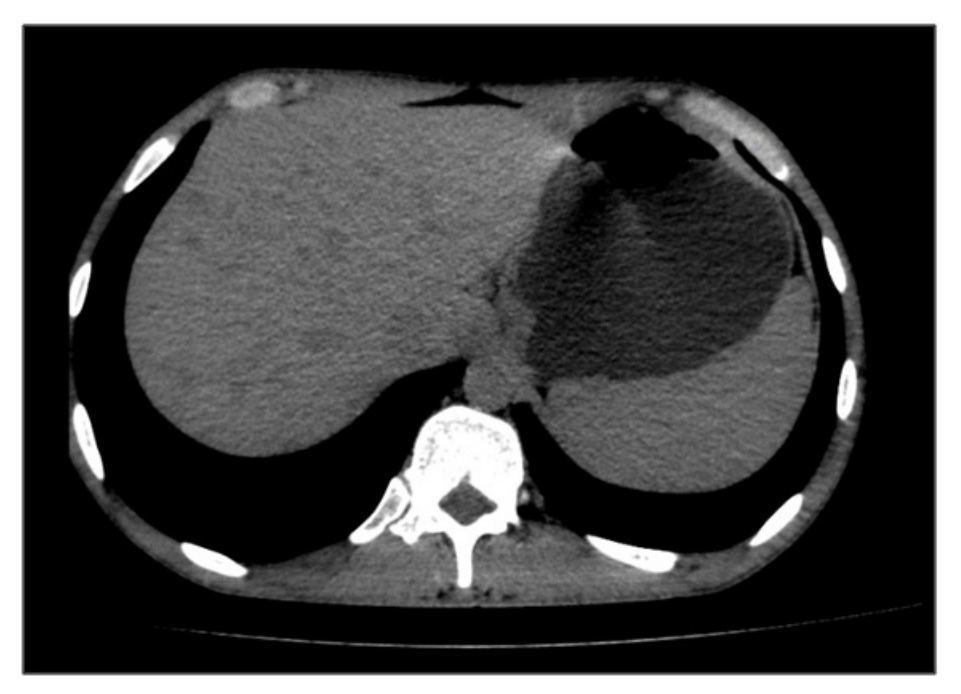
Figure 2: Multiple nodular, hypodense hepatic formations