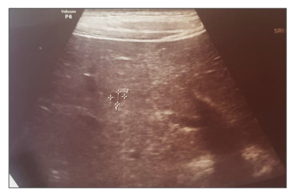
Figure 1: Abdominal ultrasound showing well-defined hypoechoic liver nodules

The tuberculosis tests performed included the search for Koch's bacilli in the sputum, which was negative, and a genomic amplification (Gene-Xpert) of the sputum, which did not show the presence of Acid-Alcohol-Fast Bacilli (AAFB). However, the QuantiFERON-TB Gold test was strongly positive. An exploratory laparoscopy was performed after inconclusive results of an echo-guided liver biopsy. The exploration showed a dysmorphic liver without macroscopically detectable nodular lesions, a slightly enlarged spleen, and hepatic hilum adenopathy measuring 1.5 x 1 cm. The peritoneum, greater omentum, small intestine, and mesentery were normal in appearance (Figure 3). Liver, omentum and peritoneal biopsies were done. The anatomopathological study of the biopsies showed necrotizing epithelioid cell granuloma lesions without histological signs of malignancy. Peritoneal and epiploic biopsies showed chronic inflammatory remodeling without signs of specificity on no visible granulomas or signs of malignancy.