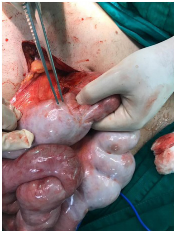
Figure 4: At laparotomy, a thick fibrous peritoneal membrane was wrapping the small bowel with adhesions.