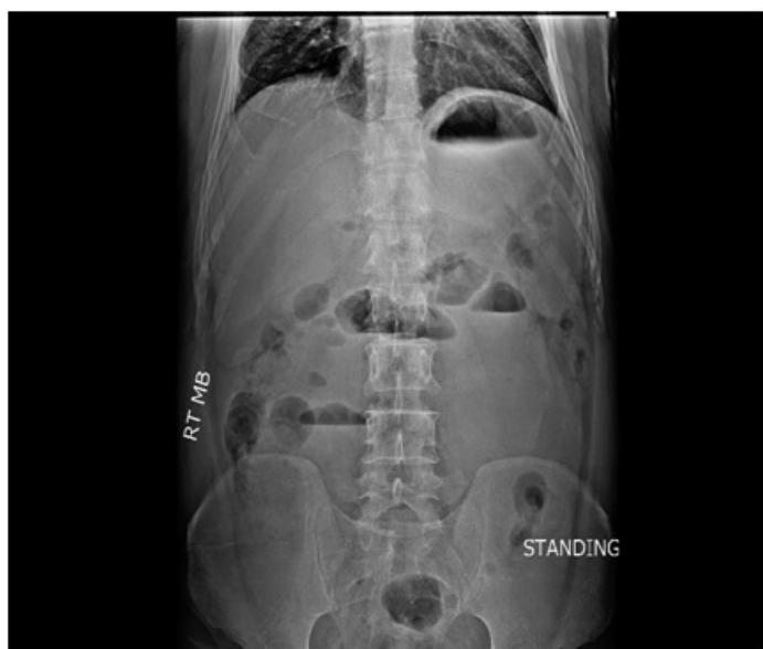
Figure 1: Standing abdominal-pelvic x-ray showing multiple air-fluid levels.

Patient was transferred to medical ward postoperatively; his stay was very smooth. Surgical dressing was done daily and showed clean wound. Fluid diet was started 12 hours post-op. Repeated scan abdomen showed resolution of bowel dilatation. He was discharged home after one week with scheduled surgical outpatient follow up after 1 month.