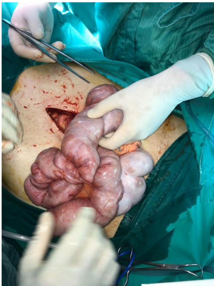
Figure 5: At laparotomy, a thick fibrous peritoneal membrane was wrapping the small bowel with adhesions.