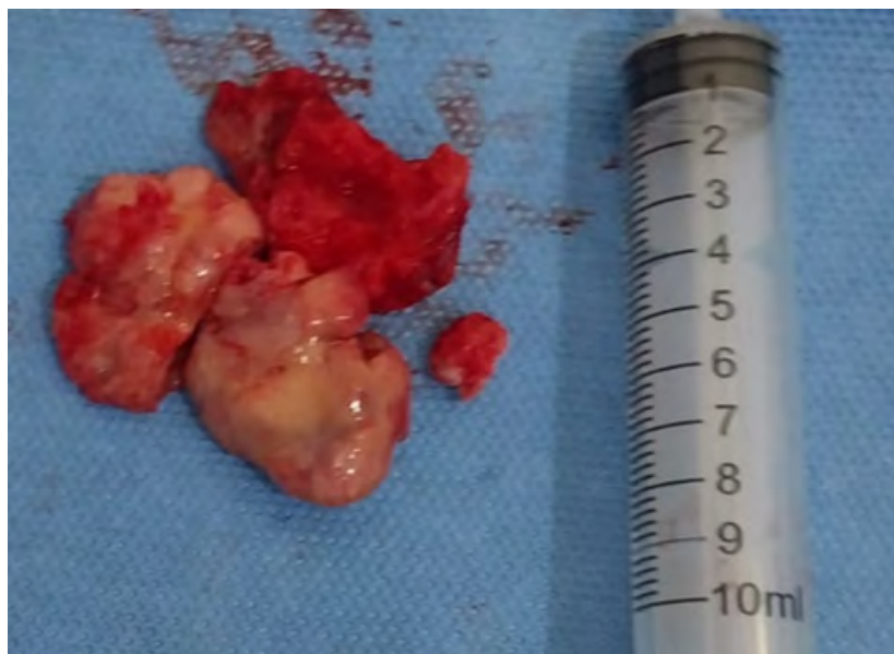
Figure 3: Image of osteoma after complete surgical excision