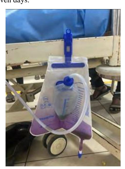
Figure 1: Purple colored urine see in the urinary bag of the patient.